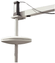
PTB210 + SPH20