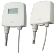
HMT120 | TMT120