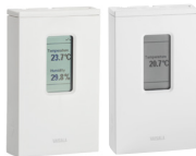
HMW90 | TMW90