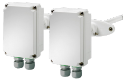
HMD110 | TMD110