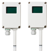
HMW110 | TMW110