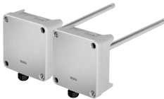
HMD60 | TMD60